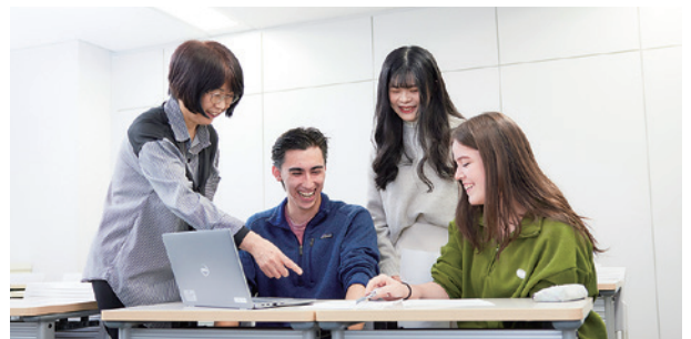
Japanese language courses are classified into 2 groups; Comprehensive and Theme Courses.

Waseda University offers international students a wide-ranging curriculum of Japanese language education. The Center for Japanese Language provides opportunities to learn Japanese language alongside the affiliated undergraduate and graduate courses. Students are able to choose classes that suit their personal objectives, from an introductory level in which students learn Japanese for use in everyday life, to an advanced level for students who wish to find employment at Japanese companies or advance into graduate studies or research in Japanese.