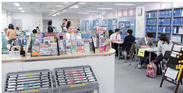
The Career Center is located on the Toyama Campus. You can find many useful materials in our office.

We also offer short-term study abroad programs featuring language training and cultural experiences, available during the spring & summer breaks. Step into a new world by taking advantage of numerous study abroad programs at Waseda!